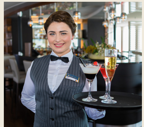
Our crew always goes above and beyond