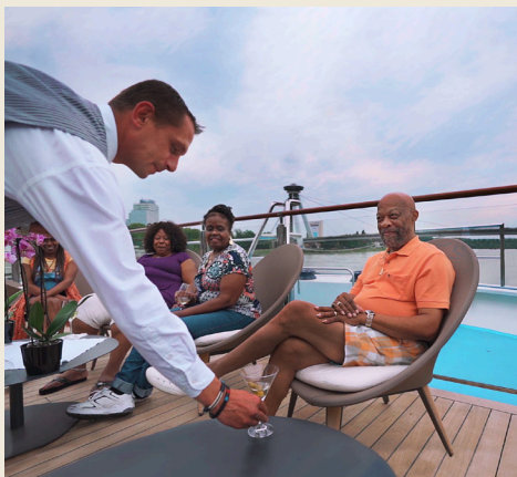
Unparalleled personalized service