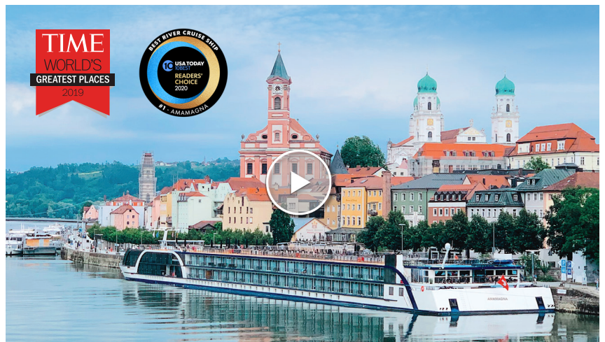
AmaMagna in Passau, Germany