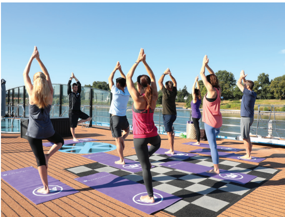
Enhance your best self