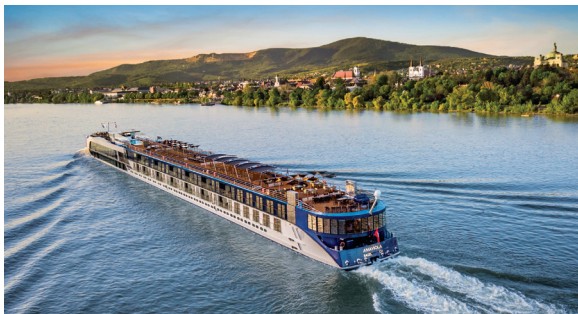
AmaViola sailing on the Danube River