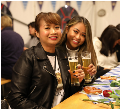
Celebrate Oktoberfest year-round at this special event held in Vilshofen, Germany.

AmaWaterways has forged strong relationships with local officials in off-the-beaten-path destinations, giving our guests exclusive access to intimate, authentic experiences ashore.