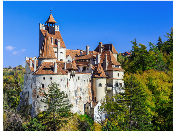
Bran Castle, Bran, Romania