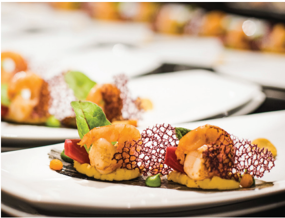
Exquisite locally-sourced cuisine