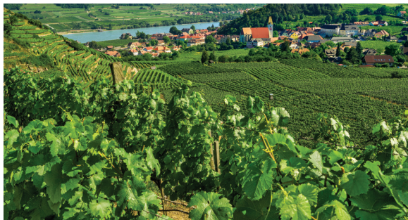
Vineyards in Austria's Wachau Valley