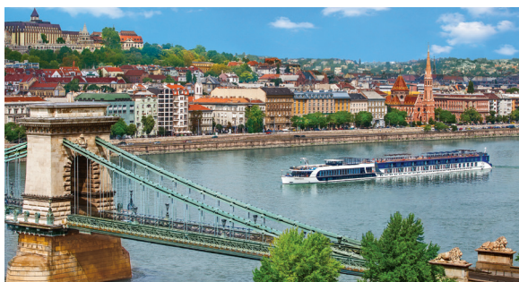
AmaSonata sailing through Budapest, Hungary