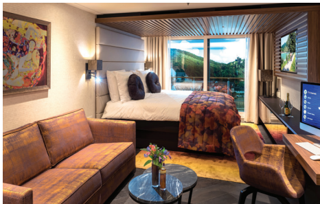
AmaMagna Balcony Suite

With fewer guests on board, you can enjoy the luxury of space to unwind, relax and reconnect with your loved ones. Our public areas, including lounges and restaurants, are never crowded.