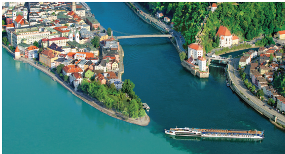
AmaPrima sailing through Passau, Germany