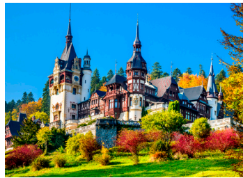
Peleş Castle, Sinaia, Romania

Cruise through the Danube River's iconic Iron Gates. Enjoy the blending of nature, art and architecture at sites such as Bulgaria's Belogradchik Rocks and the Rock-Hewn Churches of Ivanovo. Expand your world and your palate in a region rich in culture, with distinctive gastronomy including banitsa pastries, Szekszard wine and Serbian plum brandy. Plus, connect with knowledgeable Cruise Managers and crew who often hail from the countries we visit and can offer you unique expertise on the region's history as well as local hotspots.