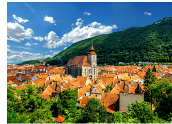
Black Cathedral, Braşov, Romania