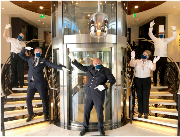
Warm-hearted crew who make your safety a top priority

Note: Amenities and services may vary by region and ship