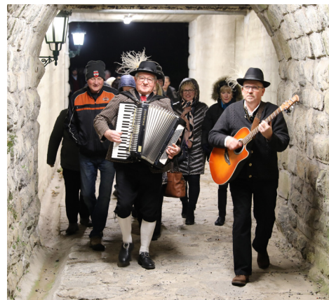
Enjoy an evening sampling famous regional wines in Spitz, Austria.