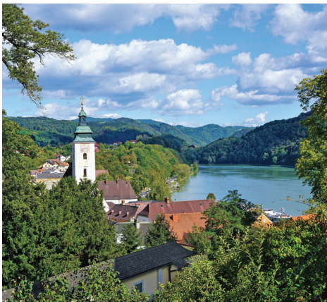
Be treated to a private castle visit and reception in Grein, Austria.