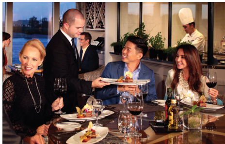
Delicious Cuisine at The Chef's Table