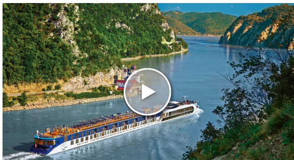
Cruising through the Iron Gates

Touch history in Hungary, Croatia, Serbia, Bulgaria and Romania, as you sail along the exotic lower Danube. Celtic fortifications, medieval towns and grand cities, along with the natural beauty of pastoral landscapes and the Danube's famed Iron Gates, showcase the best of eastern Europe. Nature lovers will relish the opportunity to see Bulgaria's natural wonder, Belogradchik, a fairytale stone world of fantastic shapes associated with interesting legends; or to bike through Belgrade's sprawling Kalemegdan Park. Wine connoisseurs will have a chance to taste history from the centuries-old wine-growing hills dating back to the Romans in Ilok, a royal and vinous town. Be treated to the flavors, sights, sounds and cultures of this diverse swath of the continent.