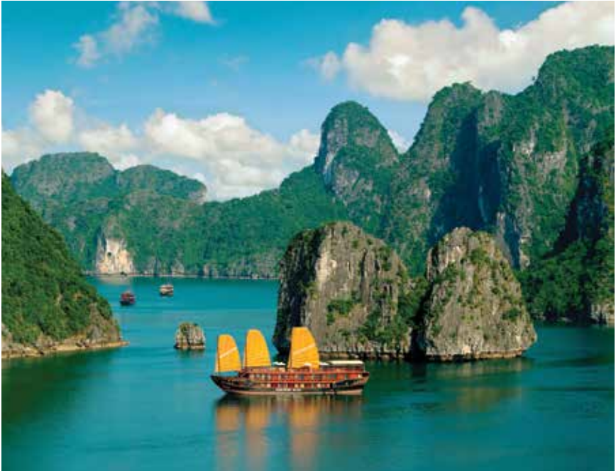
Ha Long Bay, Vietnam

Major credit cards (Visa, Master Card, American Express) are accepted in the major cities on your itinerary. Note that some shops and restaurants may require a minimum charge. Be sure to bring two credit cards, as some places may accept one type but not another. Before traveling, make sure your credit cards are activated and valid for at least 30 days after you return home. It's a good idea to let your credit card company know you may be using your card overseas, and to inquire about any transaction fees and/or restrictions.