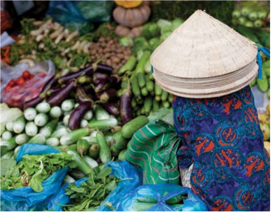
Market vendor, Vietnam