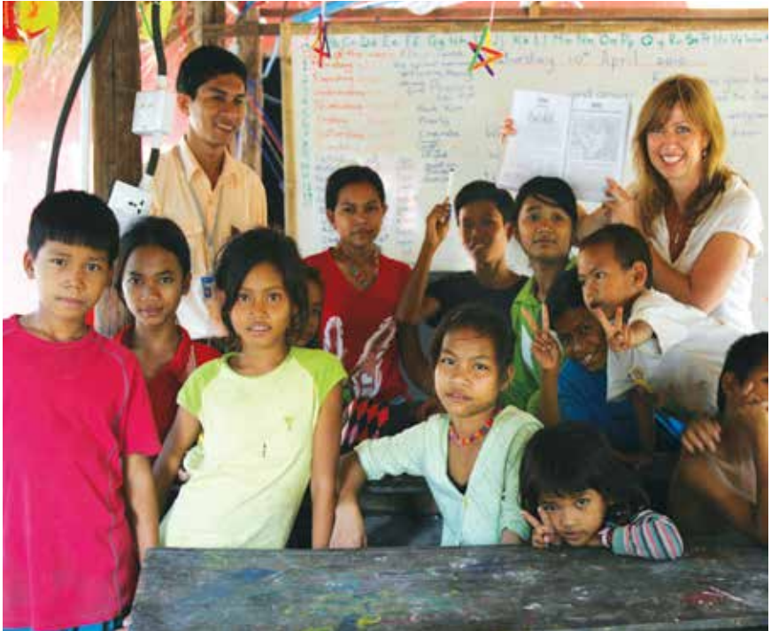
ODA Free Village English School, Cambodia

AmaWaterways is very proud to provide financial support to the ODA Free Village English School in the Siem Reap province of Cambodia. This school helps local children improve their English language skills and broaden their future employment opportunities. Surrounded by the famous temples of Angkor, residents of the area rely primarily on tourism. Guests touring the Angkor Archeological Park as part of their Cruise & Land itinerary will have a chance to visit this school during an excursion to the nearby Banteay Srei temple. Many of our guests are profoundly touched by the friendliness of the local children and wish to contribute something to their education. If you wish to bring some items from home to donate to the school, here are a few suggestions: Very simple story books with lots of pictures, UNO cards, wooden jigsaw puzzles, pencils with erasers, jumbo felt tip pens, dry erase markers, highlighters, Post-It notes, small notebooks, building blocks, toothbrushes, and small tubes of toothpaste, soap and shampoo.