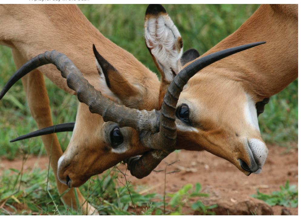
A playful day in the bush