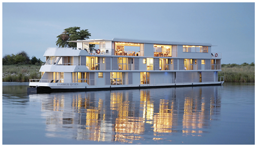
Zambezi Queen on the Chobe River