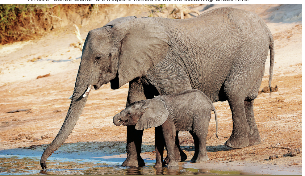
Africa's "Gentle Giants" are frequent visitors to the life-sustaining Chobe River

If you have not yet taken out travel protection/insurance, please contact your travel agent, independent Insurance broker or AmaWaterways in advance of your trip. Foreign medical care is often paid for in cash prior to treatment and medical evacuation can be very expensive. Travel protection/insurance is STRONGLY recommended for all trips to Africa.