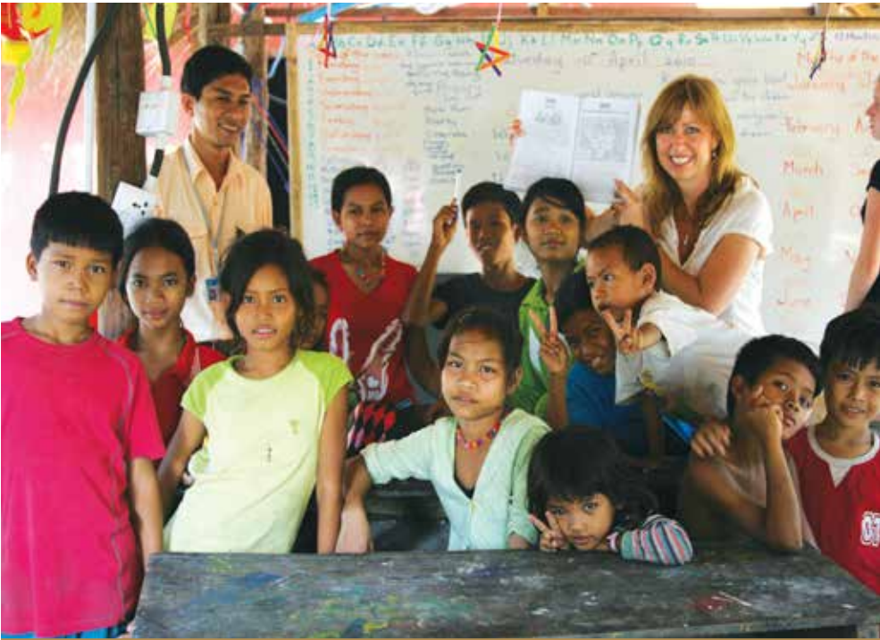
ODA Free Village English School, Cambodia

AmaWaterways is very proud to provide financial support to the ODA Free Village English School in the Siem Reap province of Cambodia. This school helps local children improve their English language skills and broaden their future employment opportunities. Surrounded by the famous temples of Angkor, residents of the area rely primarily on tourism. Guests touring the Angkor Archeological Park as part of their Cruise & Land itinerary will have a chance to visit this school during an excursion to the nearby Banteay Srei temple. Many of our guests are profoundly touched by the friendliness of the local children and wish to contribute something to their education. If you wish to bring some items from home to donate to the school, here are a few suggestions: Very simple story books with lots of pictures, UNO cards, wooden jigsaw puzzles, pencils with erasers, jumbo felt tip pens, dry erase markers, highlighters, Post-It notes, small notebooks, building blocks, toothbrushes, and small tubes of toothpaste, soap and shampoo.