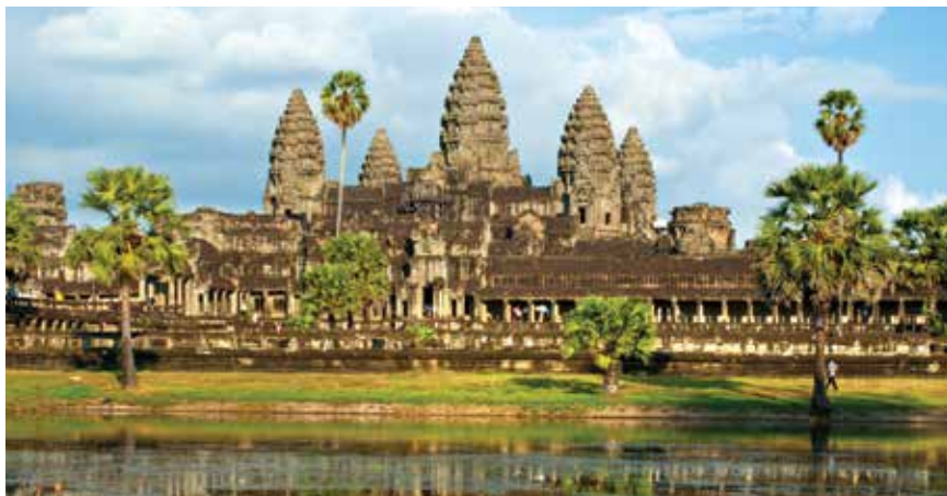
Angkor Wat - Siem Reap, Cambodia