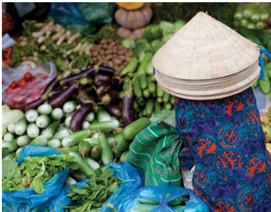
Market vendor, Vietnam