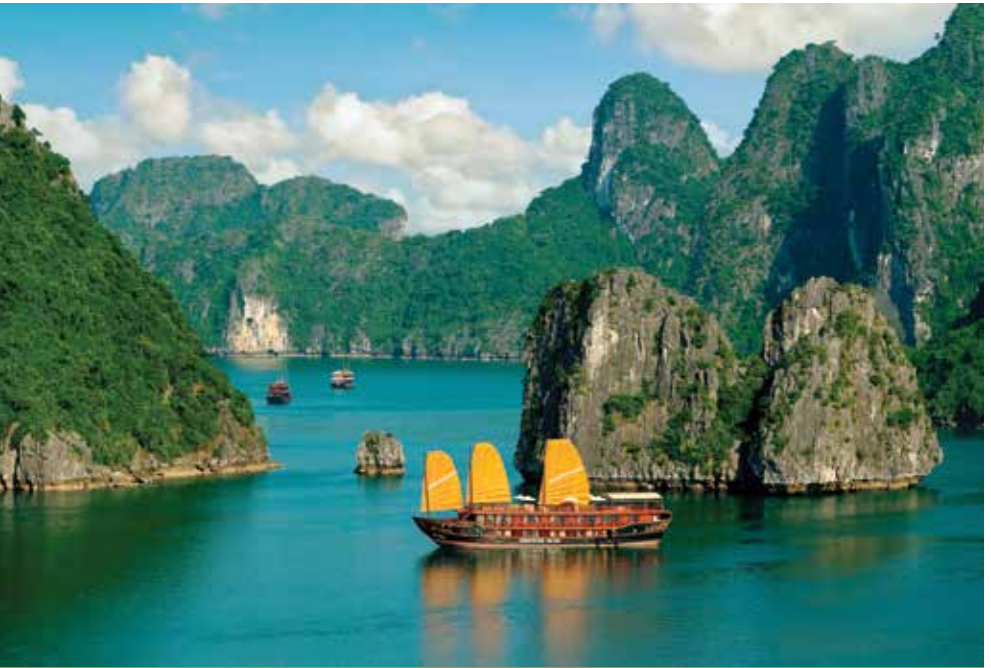
Ha Long Bay, Vietnam

Major credit cards (Visa, Master Card, American Express) are accepted in the major cities on your itinerary. Note that some shops and restaurants may require a minimum charge. Be sure to bring two credit cards, as some places may accept one type but not another. Before traveling, make sure your credit cards are activated and valid for at least 30 days after you return home. It's a good idea to let your credit card company know you may be using your card overseas, and to inquire about any transaction fees and/or restrictions.